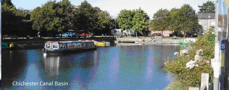
Chichester Canal Basin