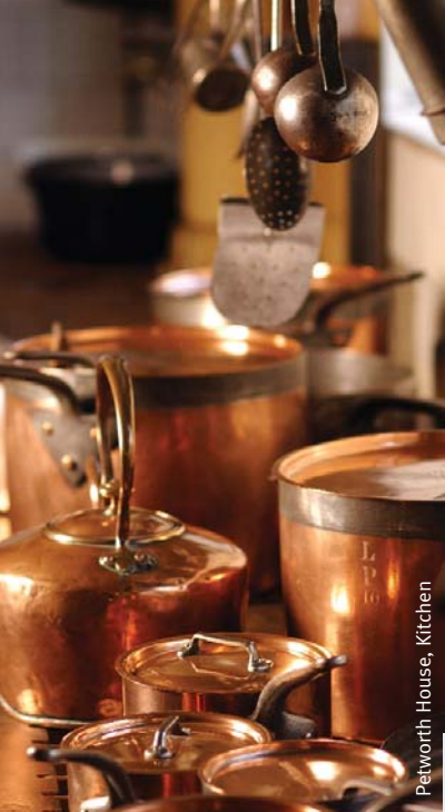
Petworth House, Kitchen